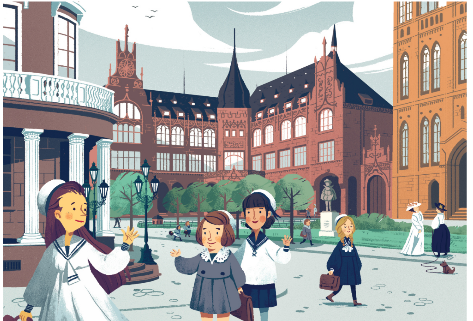
▲ "Wiesbaden around 1900" – Bachelor's Thesis