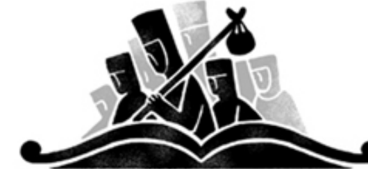
CHAPTER TEN For Their Own Good