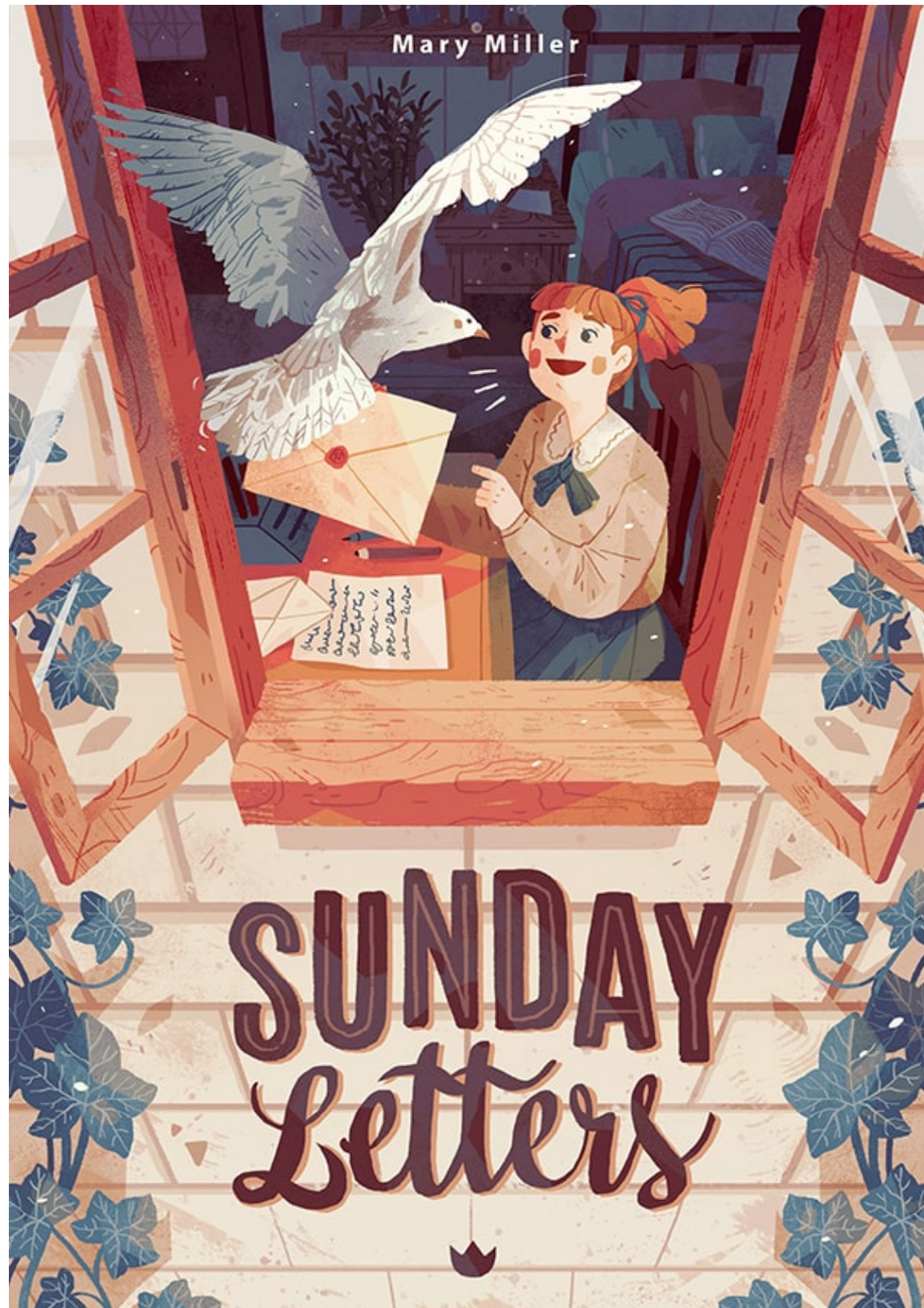
▲ "Girls' Books" – Personal Work