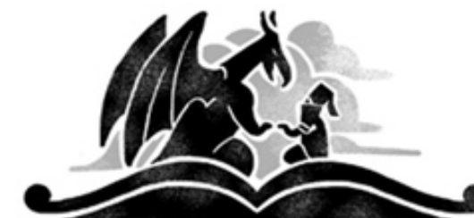
CHAPTER EIGHT A Common Cause