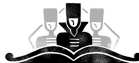
CHAPTER FIVE The Esteemed Council