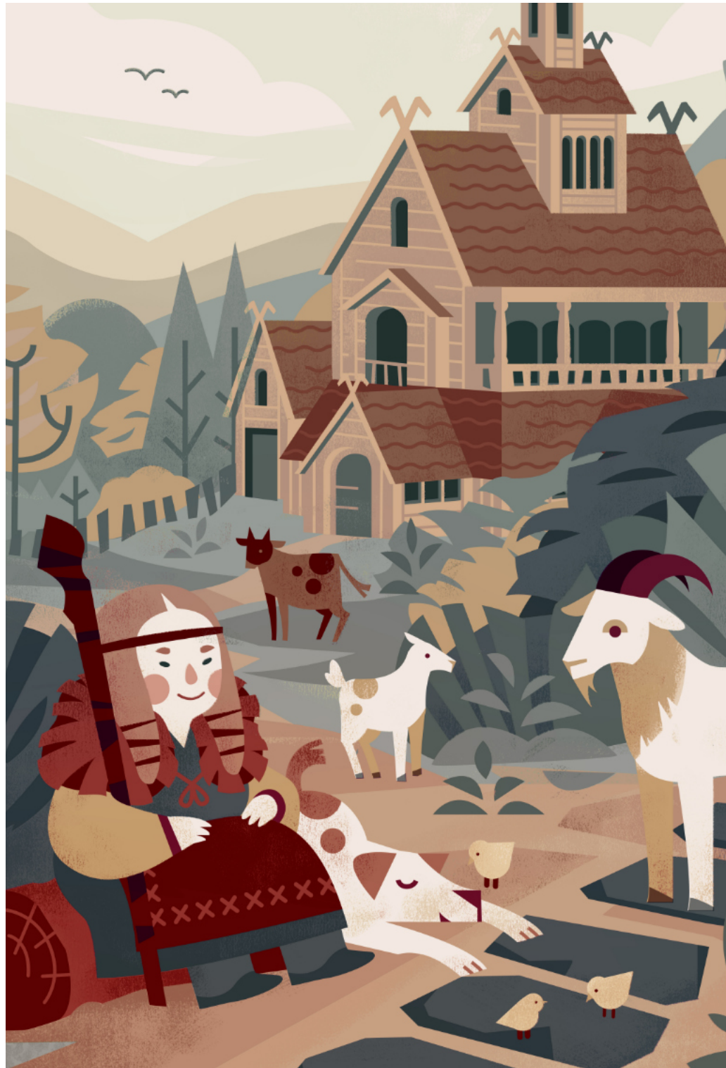
▲ "Vikings" – Personal Work