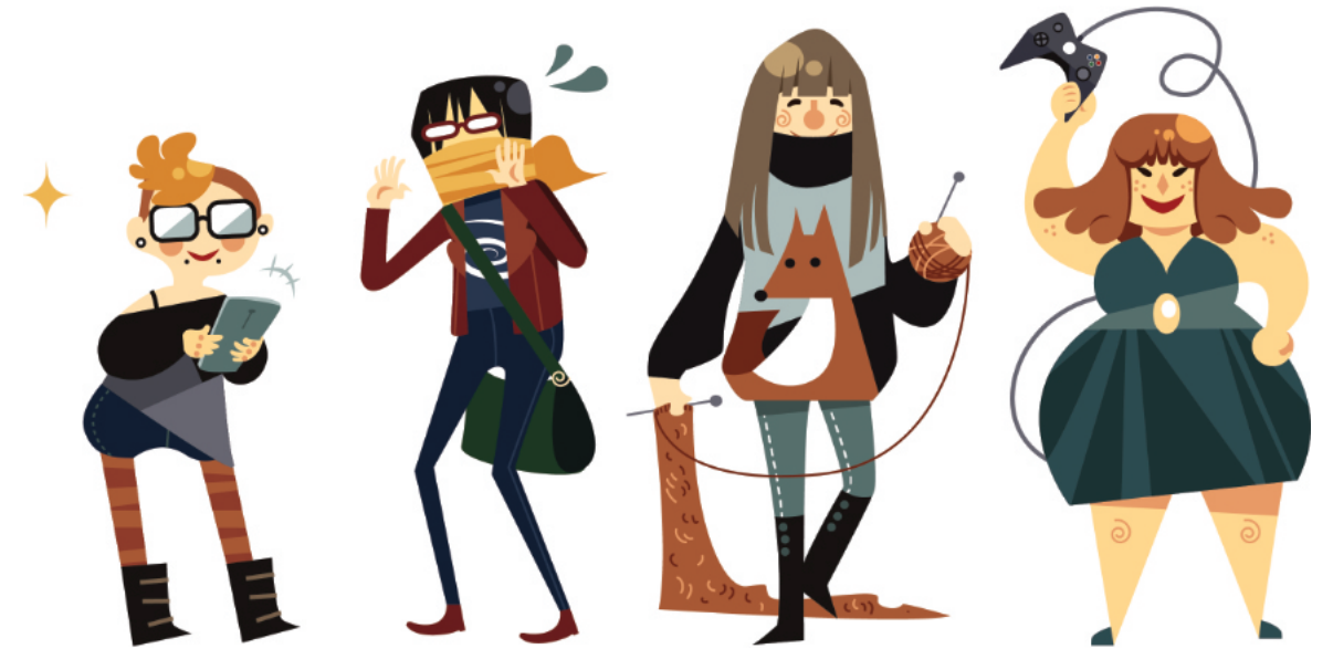
▲ "Blackout" – Ernst Klett Verlag