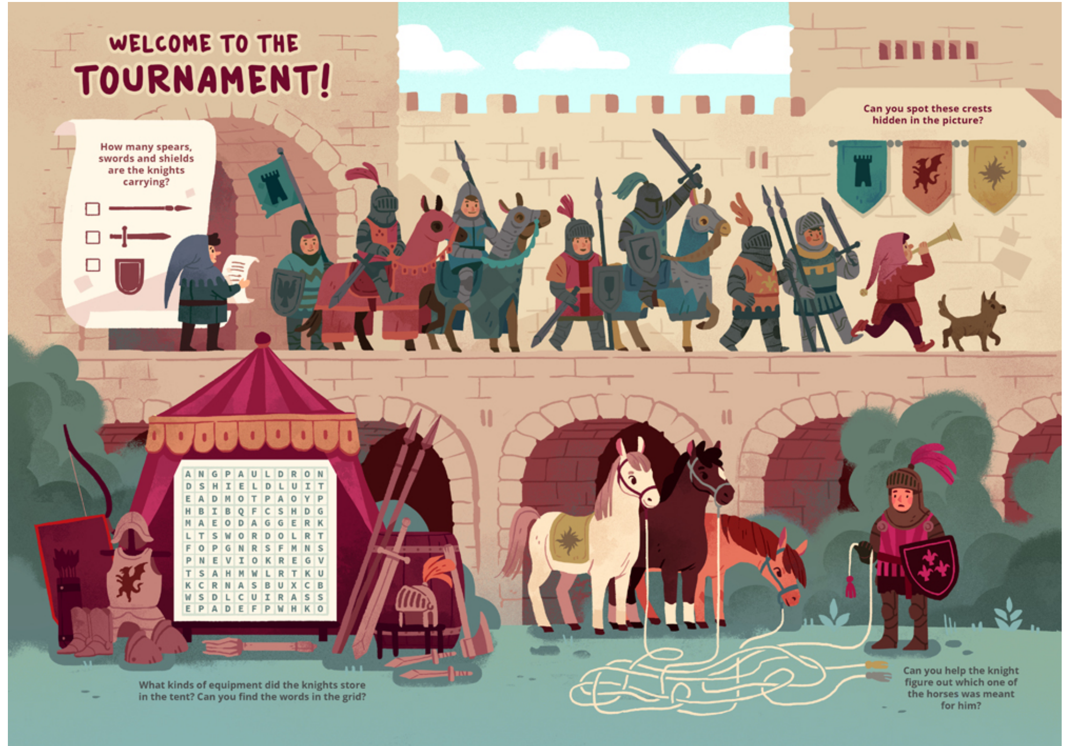
▲ "The Tournament" – Personal Work