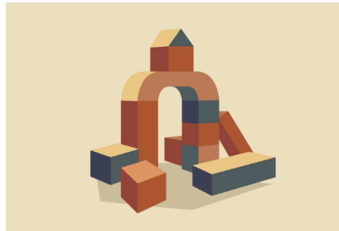
▲ "Error / Under Construction" – Client: SIQUANDO