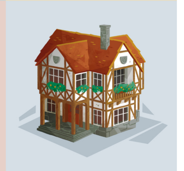
◀ "Rooms" – Personal Work