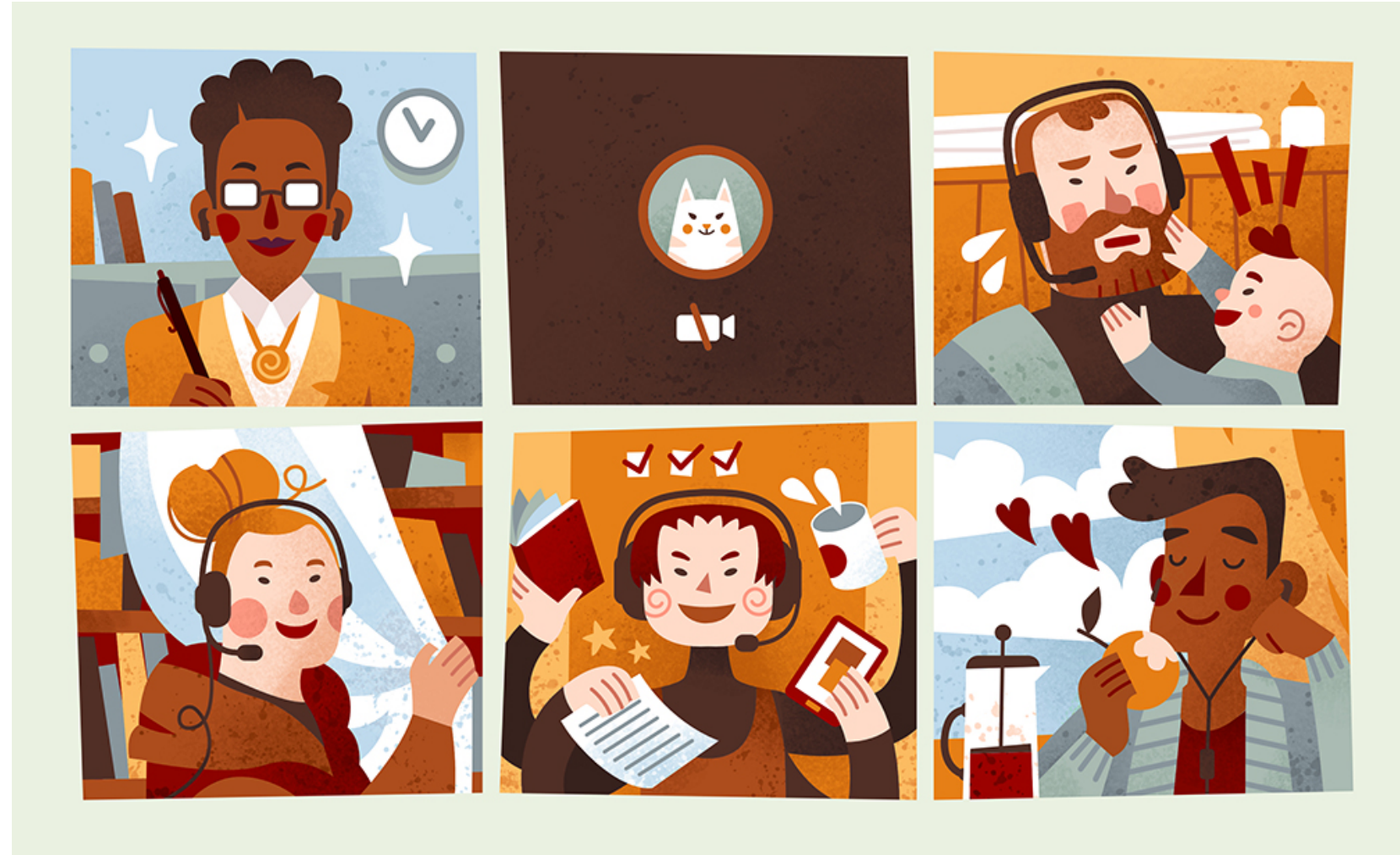
▲ "Home Office" – Client: R+V Versicherung