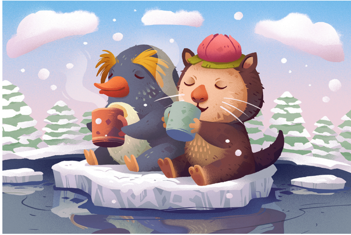
▲ "Seasonspree" – Kitewing Studio