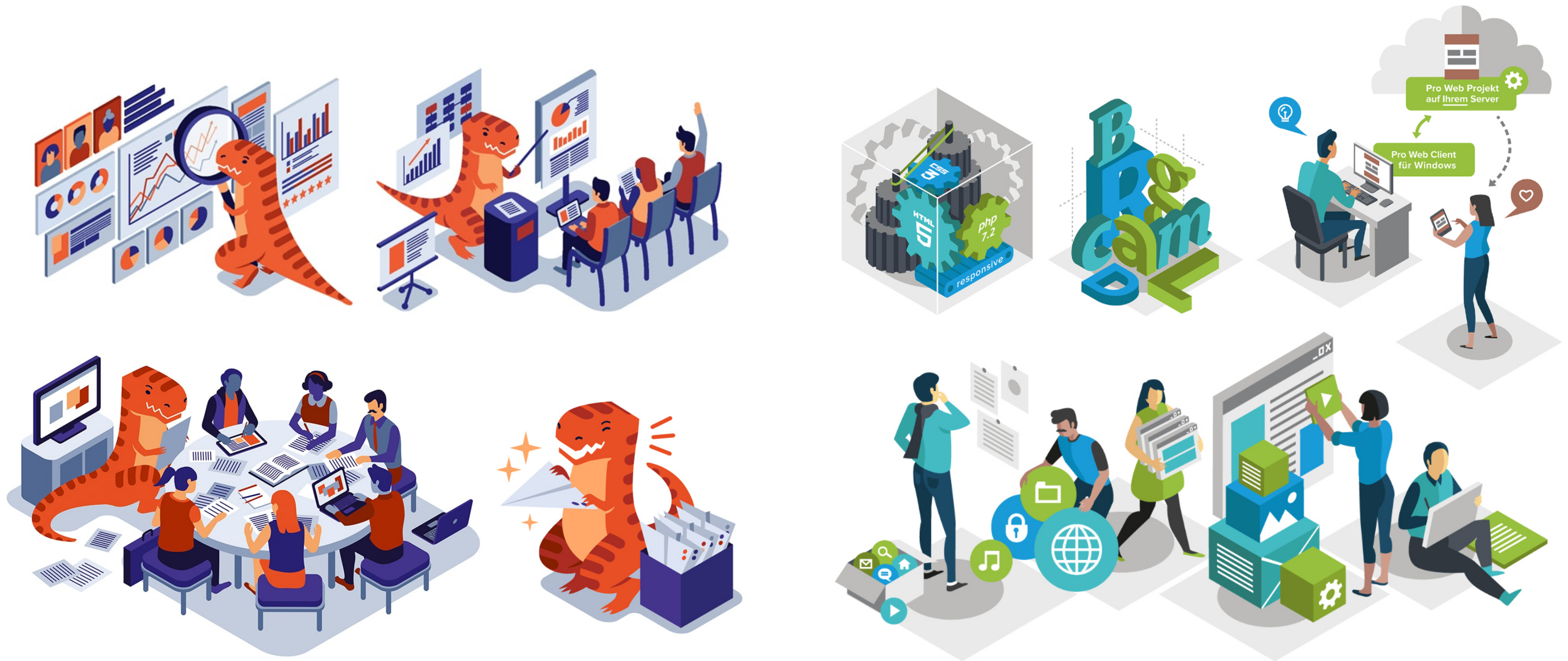
▲ "MARTREXO" – Client: Webstrategy