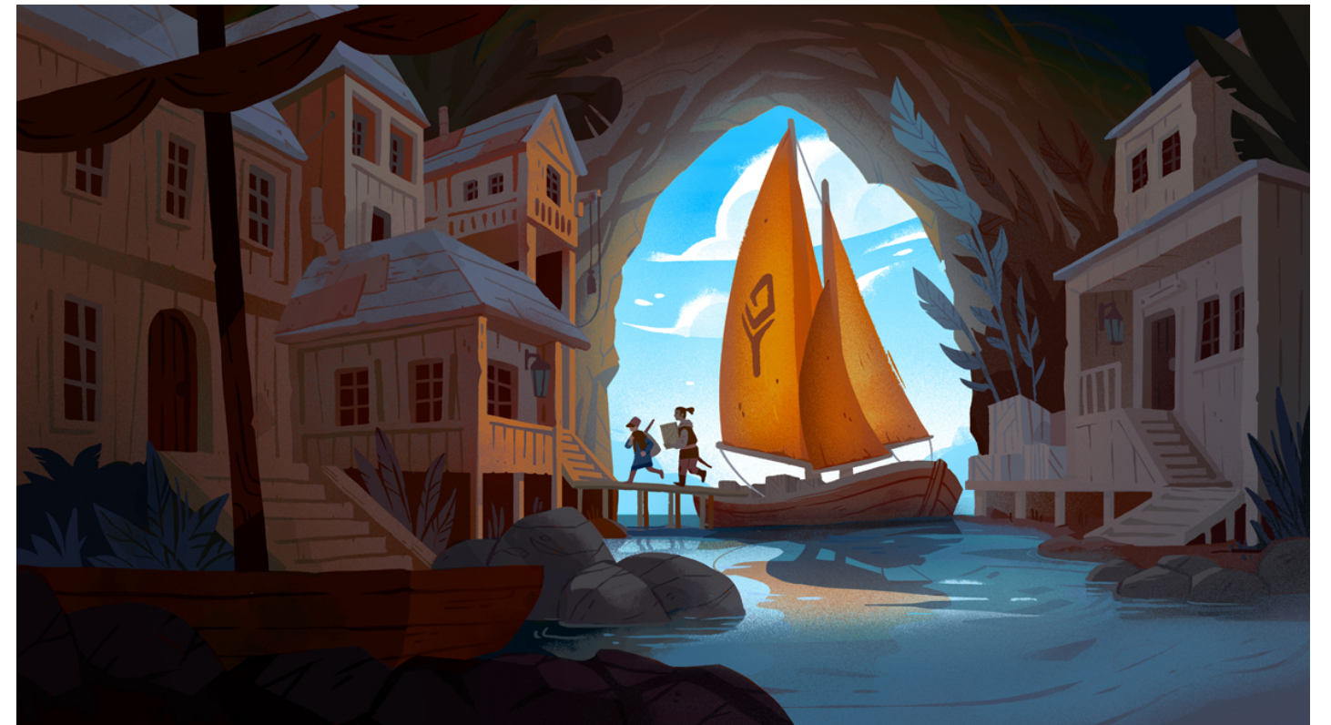
▲ "Fantasy Folks" – Personal Work